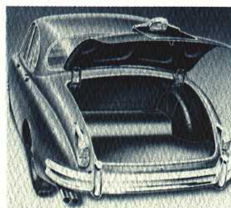
Ample luggage compartment — 13½ cubic feet capacity, with automatic interior light.