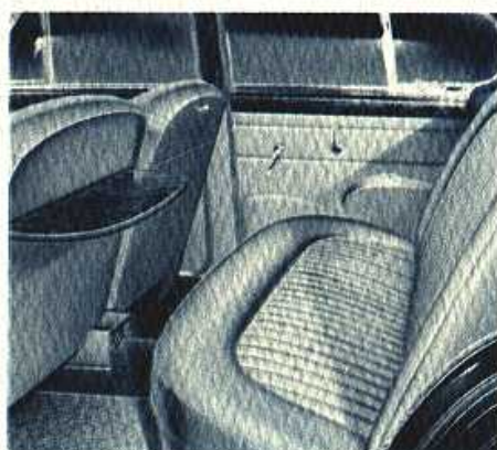
Walnut flush-fitting occasional tables; soft leather upholstery over foam rubber.