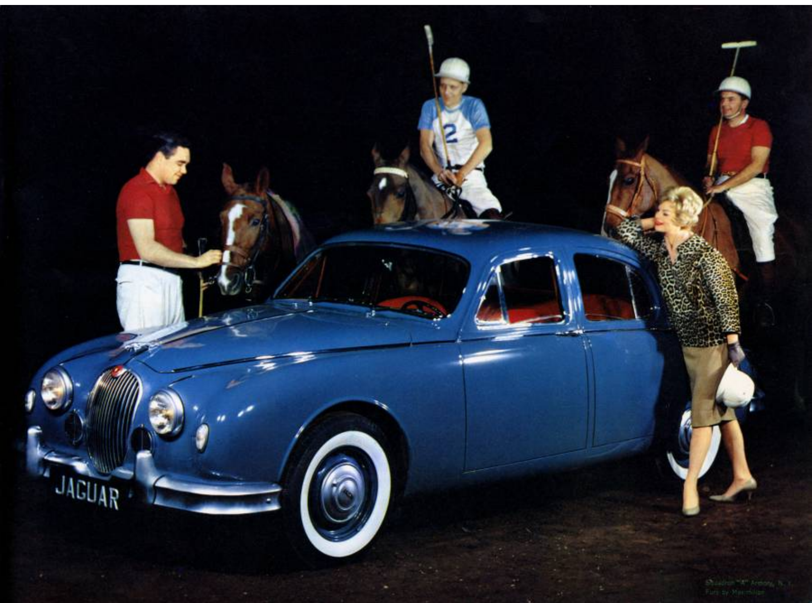
Squadron "A" Armory, N. Y.