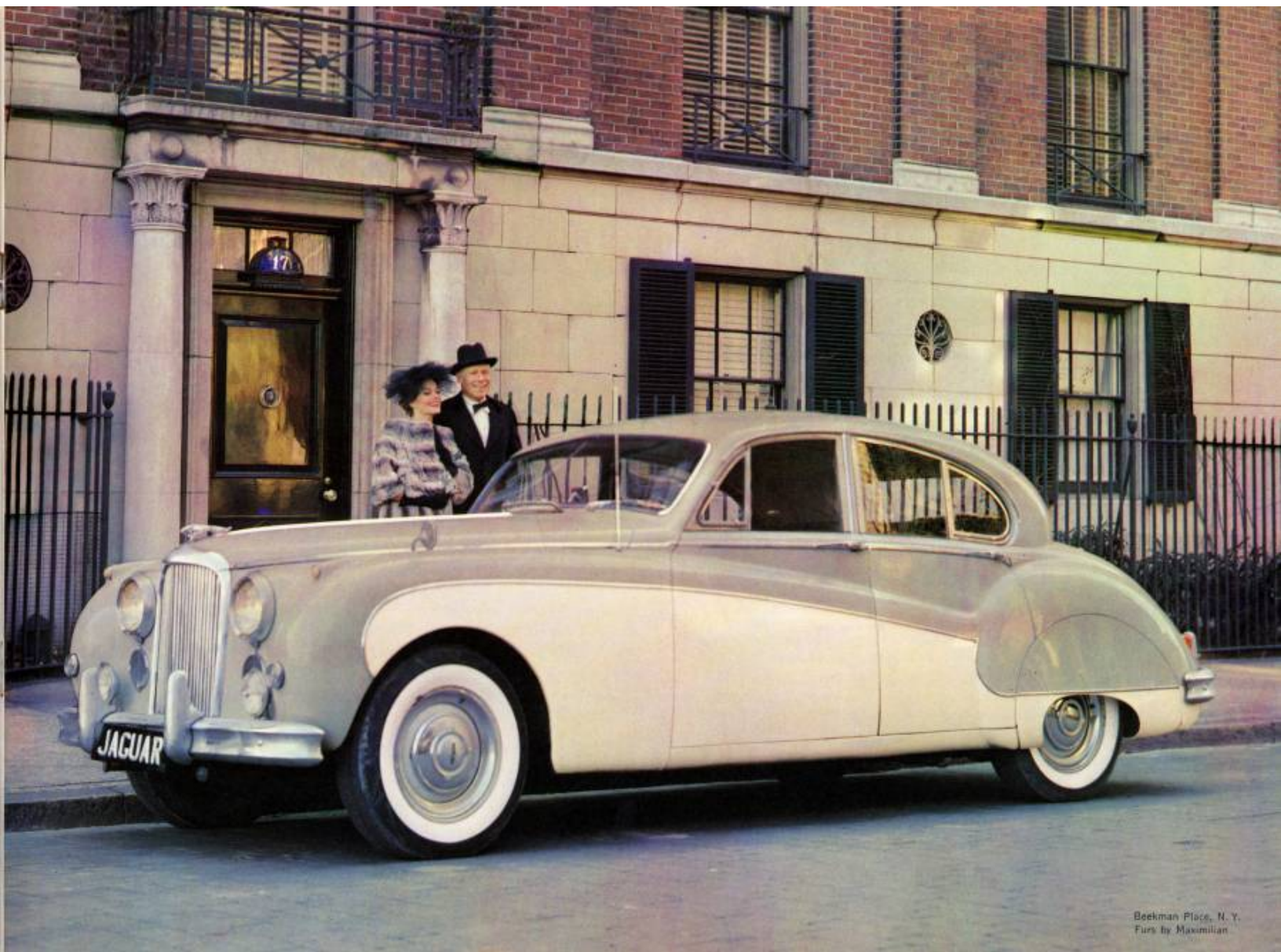
Beekman Place, N. Y. Furs by Maximilian