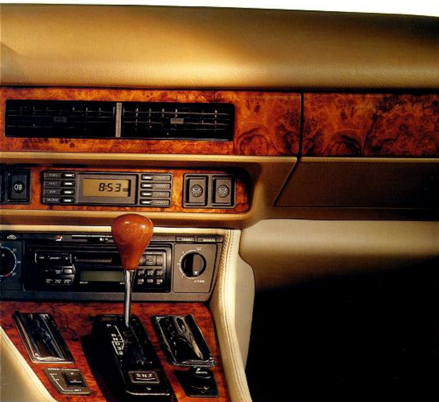
Trip computer and front fog lamps shown are optional at extra cost

Jaguars excel in both primary and secondary safety. Exceptional roadholding ability, accurate power-assisted steering and advanced anti-lock braking play a major part in this. The braking system in particular, has been further enhanced. System refinement is improved as is the "feel" provided by the brake pedal itself – accurate, sensitive and eminently controllable.