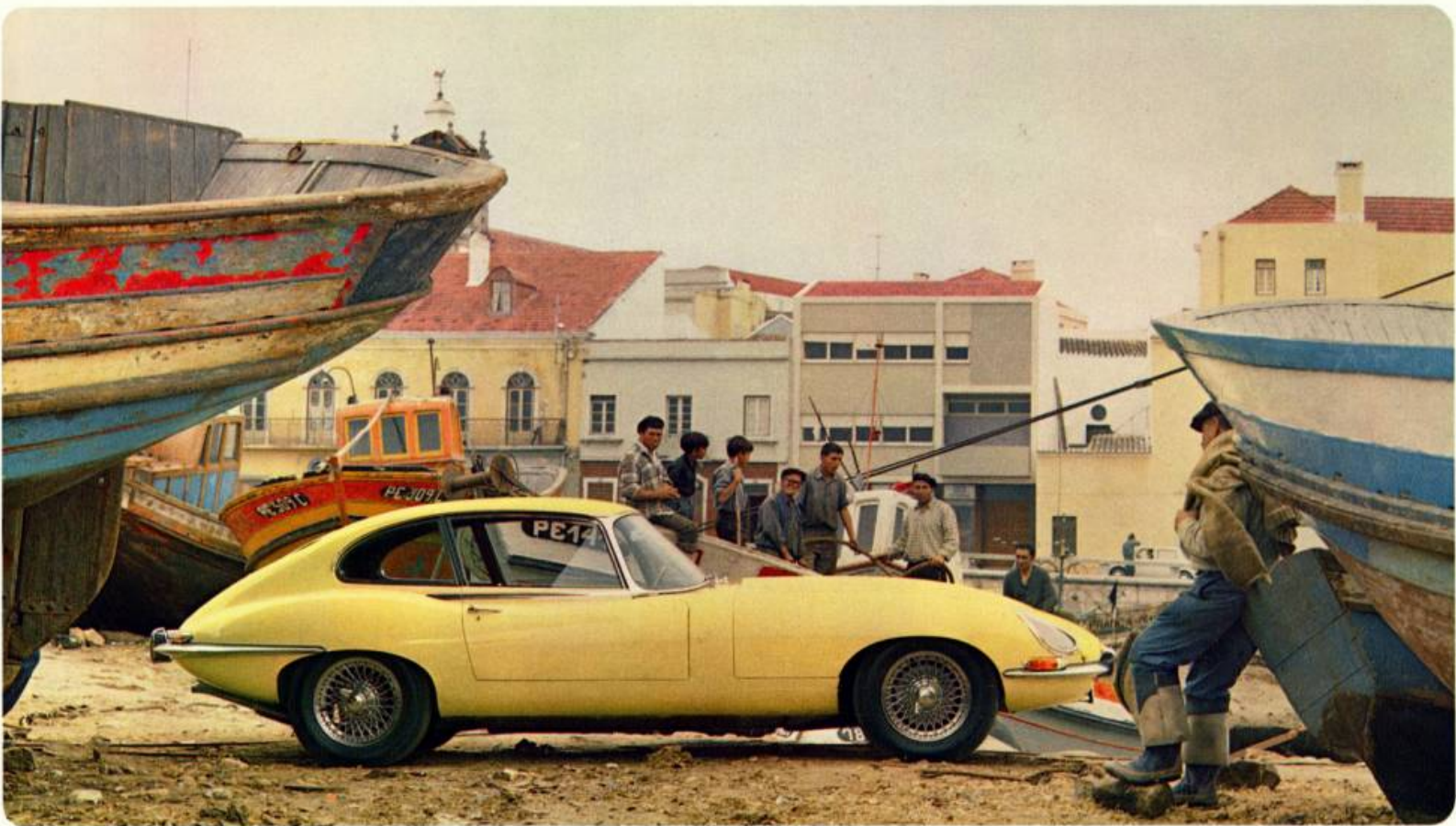
Jaguar 4.2 XK-E Coupe, Roadster & 2+2 Family Coupe "A different breed of cat"