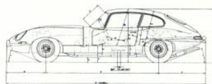
2+2 XK-E Coupe