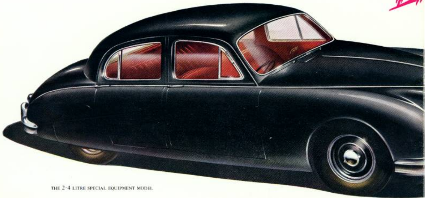
THE 2·4 LITRE SPECIAL EQUIPMENT MODEL